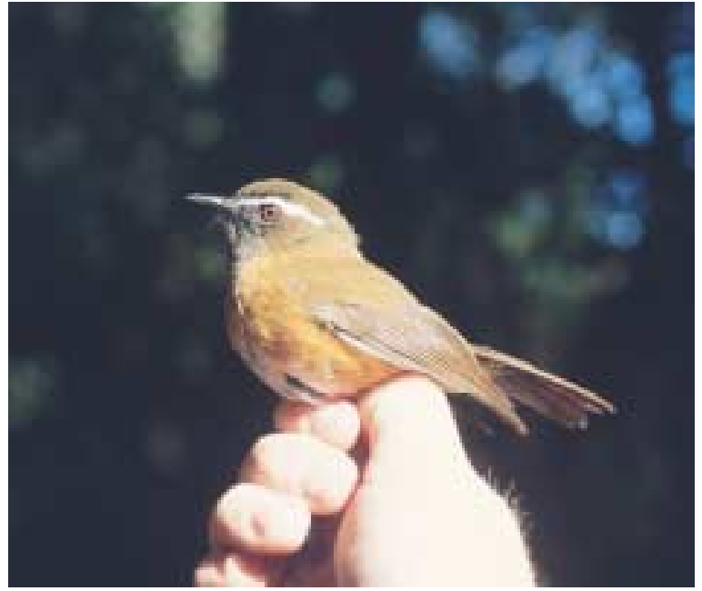
Luzon Jungle-flycatcher just released from a snare. The bird was in active tailmoult with the innermost tailfeathers growing, the next dropped and the four outermost unmoulted. No flightfeathers were moulted.

Map by Birdlife International Red Data Book Asia.