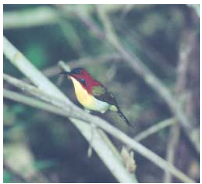
Lovely Sunbird on Palawan. Different races with the birds on Palawan being the biggest and has longest tail.

FLAME-CROWNED FLOWERPECKER NT E 8 on Mt Polis