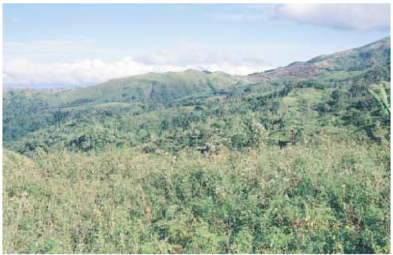
Deforested hills on Negros. The ramaining forest here is still being cut and converted to farmland.