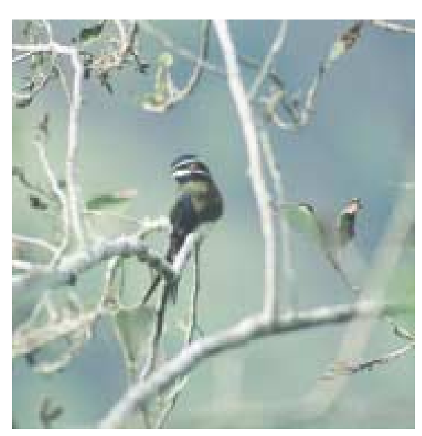
Whiskered treeswift at Mt Polis

1 from a bridge at the University Campus, Makiling. 1 probably heard from another stream near the Animal Husbandry in the same general area.