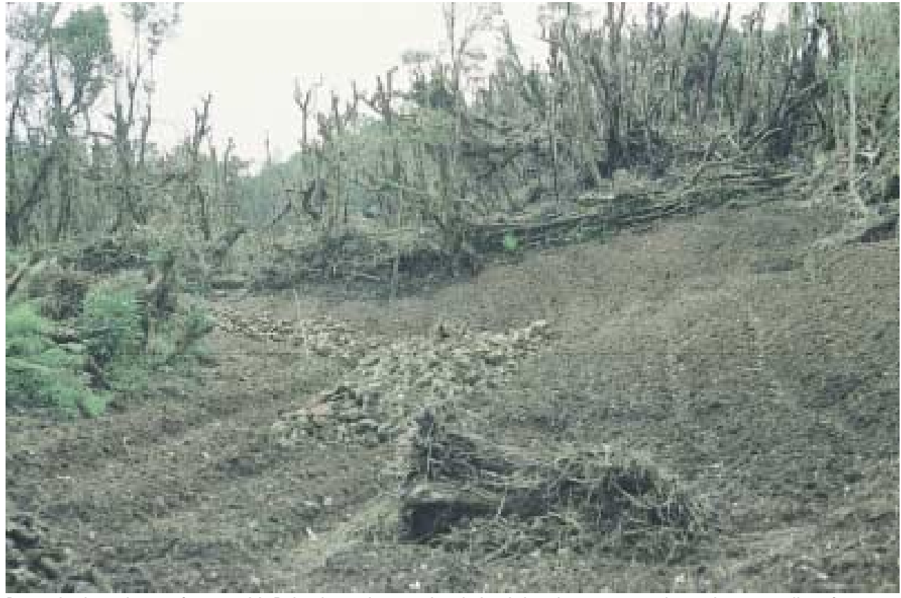
Recently cleared moss-forest at Mt Polis above the pass. Just behind this clearing starts the trail into excellent forest.